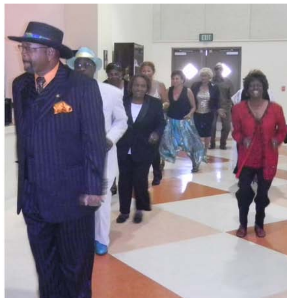
“Seasoned ambassadors” dancing at a September 2011 event – don’t stop moving, looking GOOD!